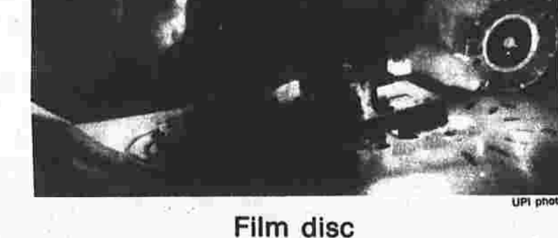
Film disc The "heart" of Eastman Kodak Co.'s new line of compact cameras is a rotating disc of film shown here being checked in a Rochester, N.Y., laboratory. Each disc has 15 images that are cooled during printing to ensure the flatness and rigidity needed for high-quality prints, says Kodak. The disc cameras are powered by lithium cells.

The storm — raging at hurricane force — continued throughout the night and on into Tues. Feb. 7, and before it subsided three to four feet of snow smothered parts of southern New England. The region's largest city — Boston — was battered into paralysis. Along the New England coast, the highest tides of the century tore away at the shoreline un-