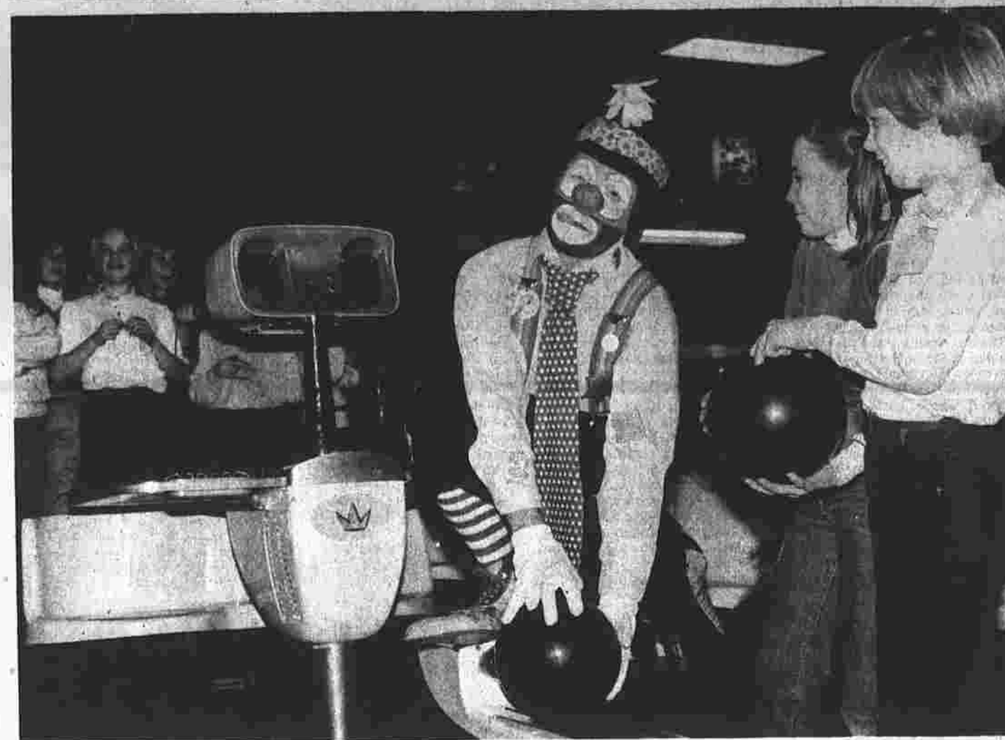
Bowling tips offered youngsters