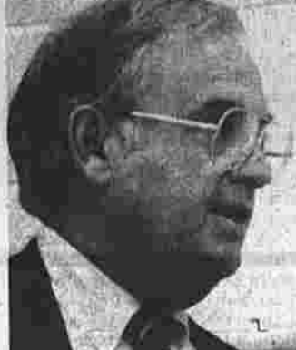
SEN. LOWELL WEICKER ...anti-Reagan?

WASHINGTON — The National Conservative Political Action Committee, which in 1980 played a major role in defeating a handful of liberal senators and changing the complexion of the U.S. Senate, has unveiled the second phase of its efforts to defeat Sen. Towell Weicker, R-Conn.