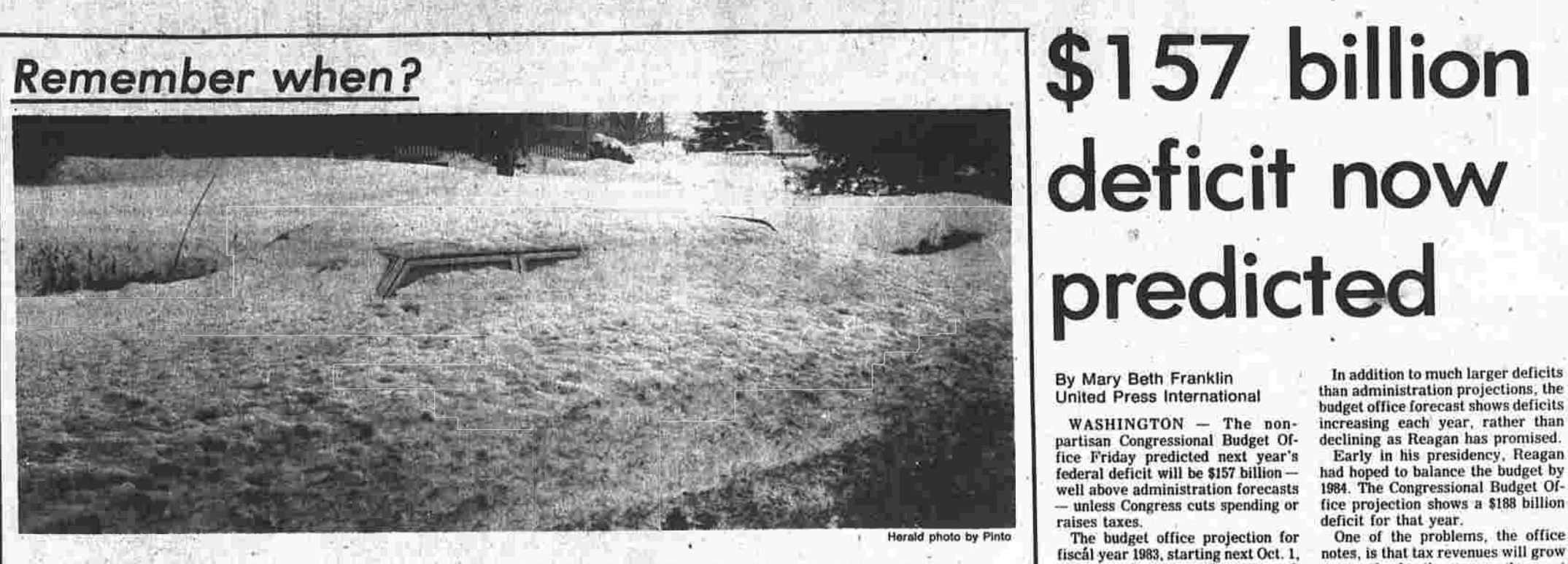
A casualty of infamous Storm Larry lies buried along Keeney Street. Exactly four years ago today, the hurricane-like blizzard began dumping what would eventually be 16 inches of snow on the region, closing down schools, businesses, even streets as nine foot drifts blocked roadways.